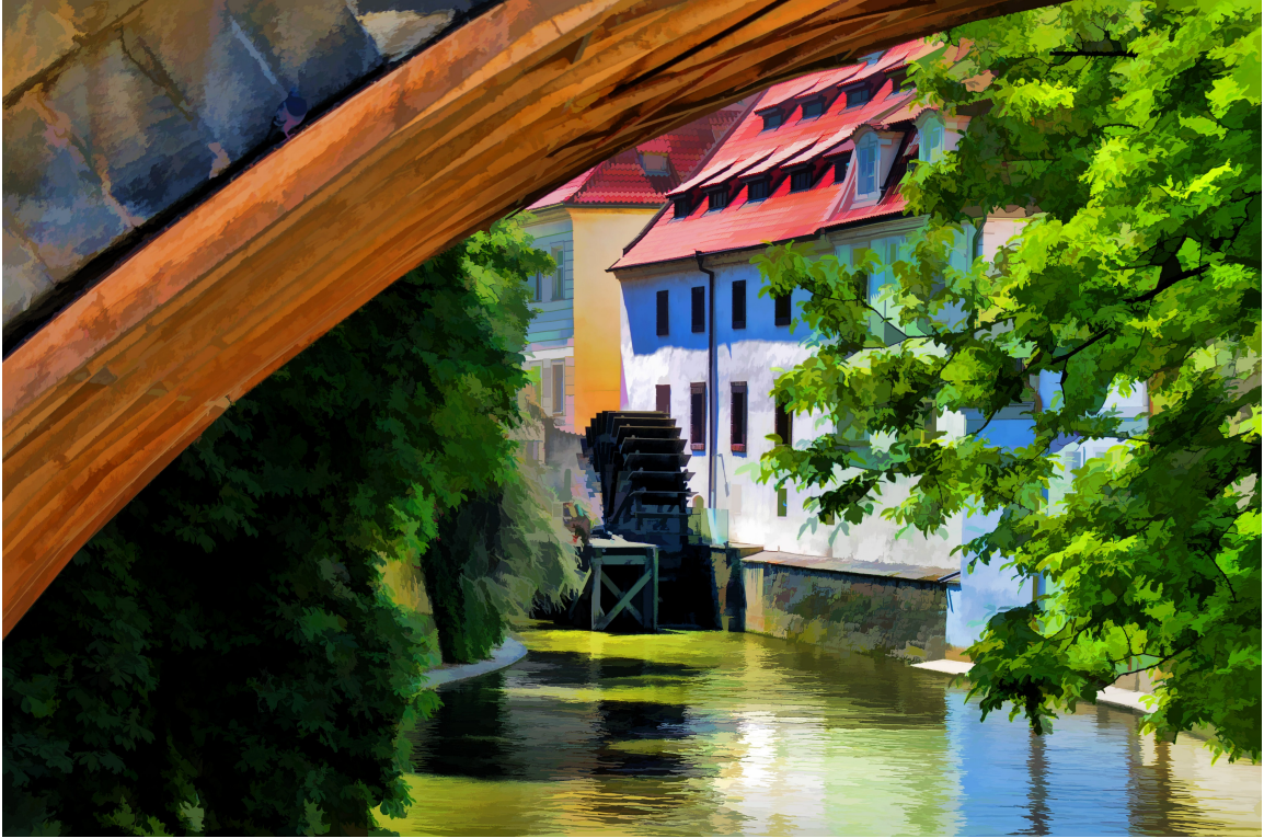
Topaz Simlify BuzSim